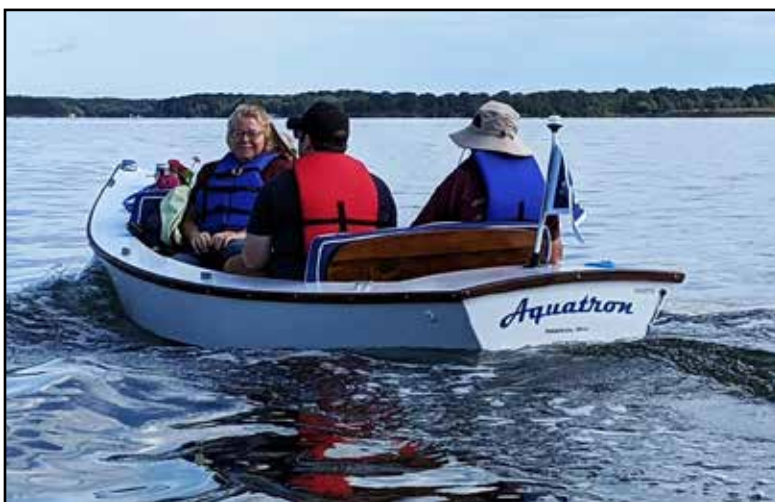
"Aquatron" finished first in its class. The Fannons were happy with the performance of the boat, which showed about 20% battery power left after the five-hour run.

After our stop, we shoved off and had the lunch that Melissa had packed in the antique picnic basket borrowed from her niece. It was perfect weather: sunny and warm, blue skies with fluffy white clouds. We saw several bald eagles, blue herons, and cormorants along the river. We were joined by one of the "chase boats" manned by the editors of Prop Talk Magazine , who were covering the event and took many pictures of us from