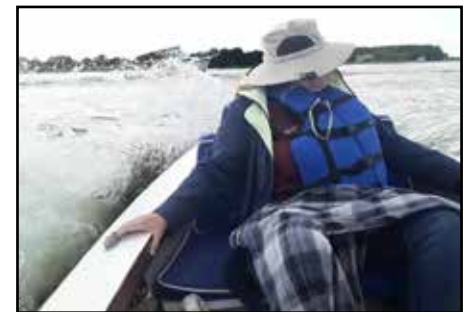
Crashing through the wake of a 50-foot yacht.

Landing where there was a mandatory and for us, necessary, ten-minute stop. After we tied up