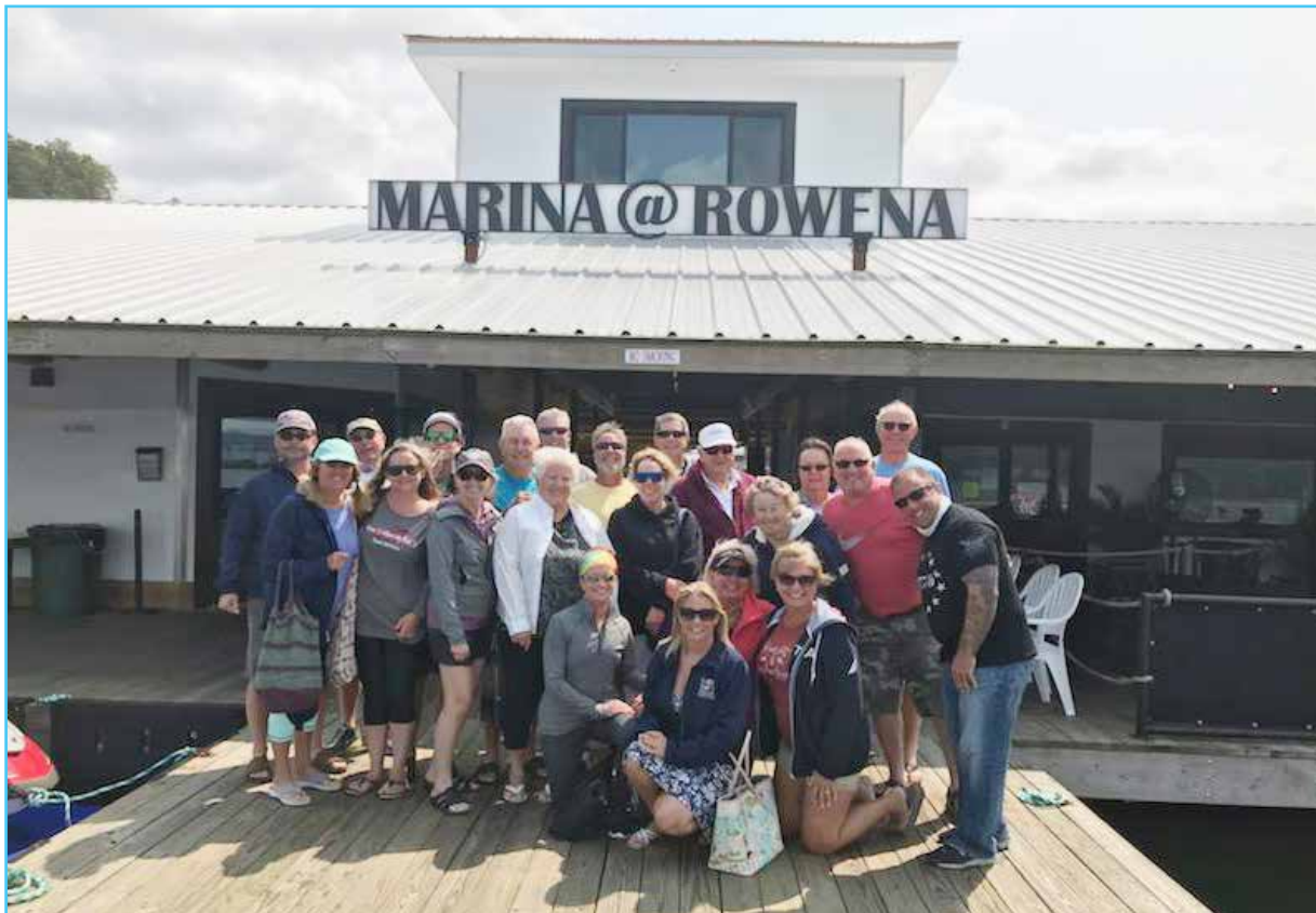
The Lake Cumberland Gang - September 2020

Please note: The United States Power Squadrons and America's Boating Club of Central Ohio do not endorse any candidates in the upcoming election.