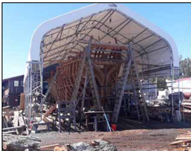
One of the many projects going on at the Chesapeake Bay Maritime Museum is the building of the "Dove". The Fannons spent Saturday touring the museum grounds.