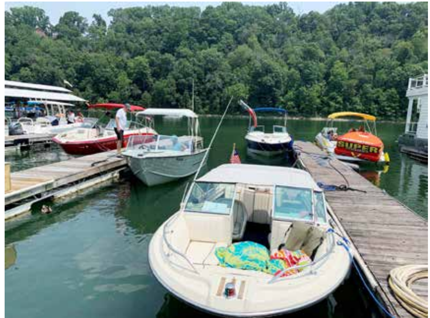
Getting ready to go!