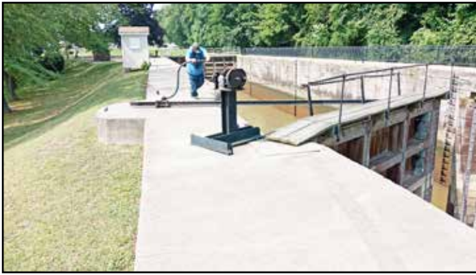
Lock Keeper opens the gates

90-degree afternoon. Melissa ordered the beer fries and I had the onion rings which were very good and we downed a couple of cold ones (diet pops).