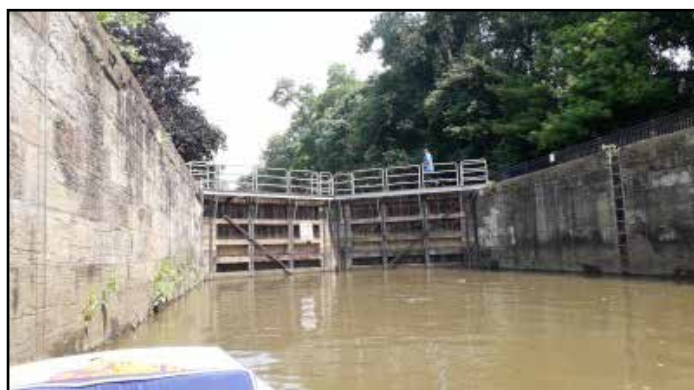
My boat was very small inside of the lock

The lock is 36 ft x 184 ft and my little boat was swallowed up inside of it.