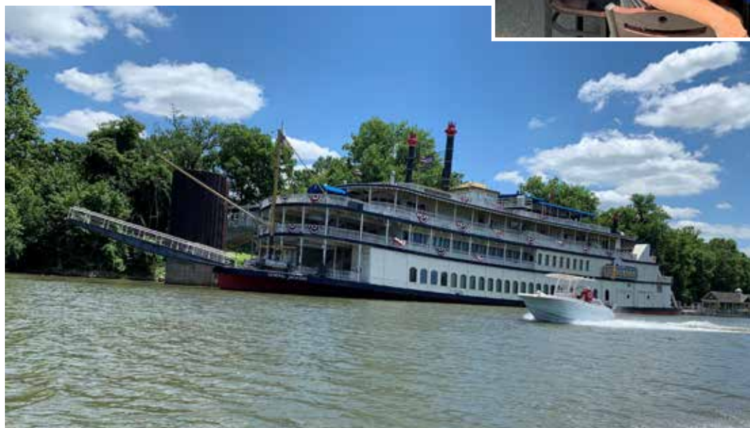
Passing the General Jackson Showboat.