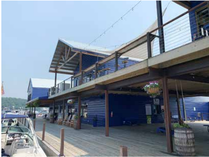
Beaver Creek Marina