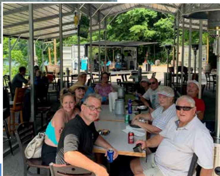
A quick trip to Lake Barkley.