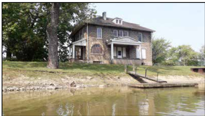
The Lock Keeper's House

There had been no other boats on the river that we had seen until a couple of pontoon boats sped past our slow-moving electric launch. As we continued south we passed under Interstate 70 and we were able to see the "Y" bridge ahead and the dam in front of it. I wouldn't want to approach the dam in poor lighting conditions as the drop off is difficult to see and there are only a few buoys warning of its proximity. No cable, no orange barrels keeping you from going over a 14-ft drop. We moved to the east shore of the river where a green buoy marked the navigation channel and entered into a canal that led to the locks. The canal is about \frac{3}{4} of a mile long and takes you under a railroad lift bridge, the "Y" bridge, US 40 drawbridge, a railroad swing bridge and the Sixth Street drawbridge. I doubt that any of these bridges have been lifted or swung in the last few decades.