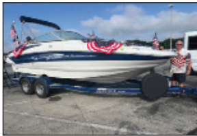
Goelz — Secondwind