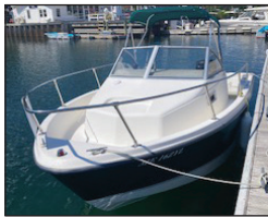
Hughes — Singularity

There is room for your GG Sponsorship boat photo here!