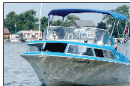
Crothers — New Moon

There is room for your GG Sponsorship boat photo here!