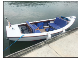
Fannon — Aquatron