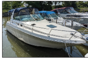
Rayburn — Tool-n-Around