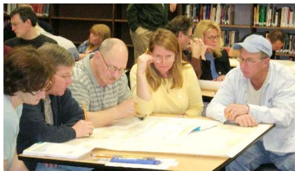
The Charting Session of the February Boating Class.