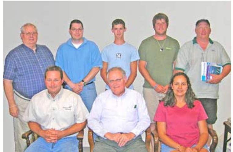
The Seamanship Class 2008

In my July 29 th phone conversation with National I was told that there have been delays in distributing materials for the beta version of Navigation. The final version of Navigation was to be available to us for use in class about October first. The delay in distribution of the beta version will translate to a delay in the October first distribution date of the final version. The people at National were unable to give me new distribution date. We may be forced to