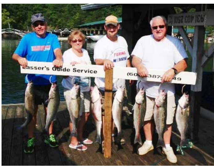
Just another day on the lake. Anyone for a fish fry?

The National Weather Service has proposed a change to its graphical forecast Web pages and is asking for comments. You can access the new website at http://preview.weather.gov/graphical . The new user-friendly graphical display enables instructors as well as students to see the effects of weather systems on temperature, humidity, wind speed, etc. Please leave your comments using the survey link in the top left portion of the site.