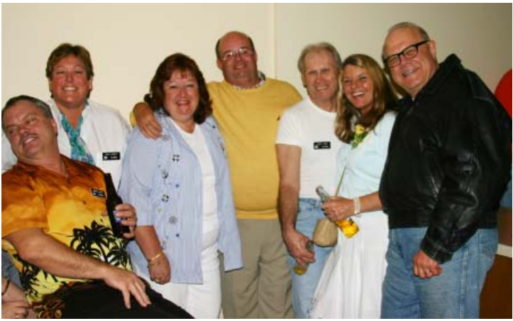
CSE&PS was well-represented at the Fifties Party!