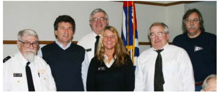
These "First Timers" enjoyed their first District Conference!