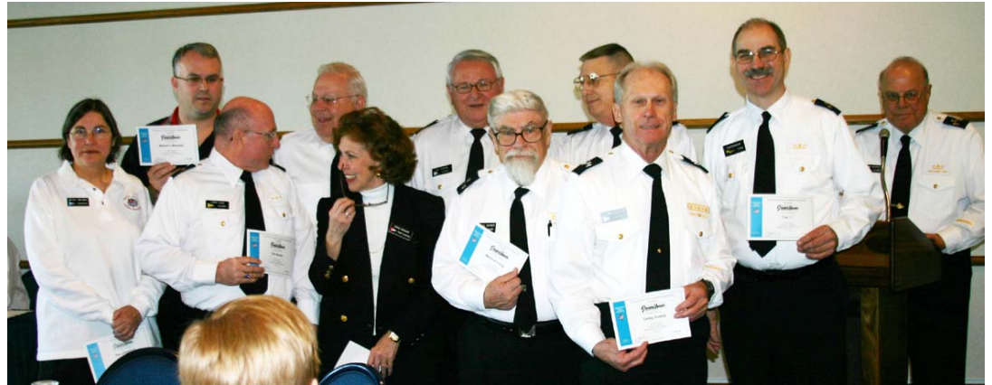
District newsletter editors and helpers received Distinction in Journalism Awards.