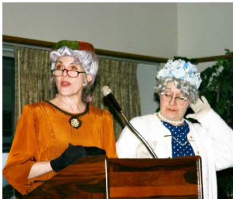
The "Sister Act" kept everyone in stitches!