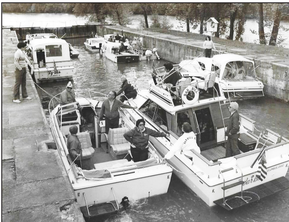
1979 CSPS Muskingum River Cruise