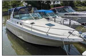
Rayburn — Tool-n-Around