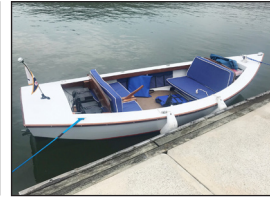
Fannon — Aquatron