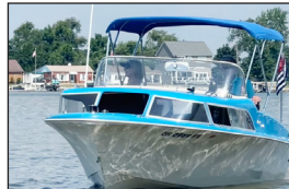
Crothers — New Moon

Show off your pride and joy here! Join the Galley Gossip Sponsors Club today!