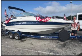
Goelz — Secondwind