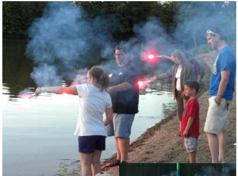
Smoke, Smoke, Smoke - it's a flare demonstration.