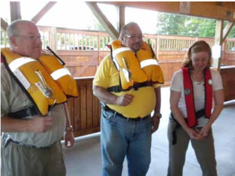
Experiencing an inflatable life jacket is very cool. Really!