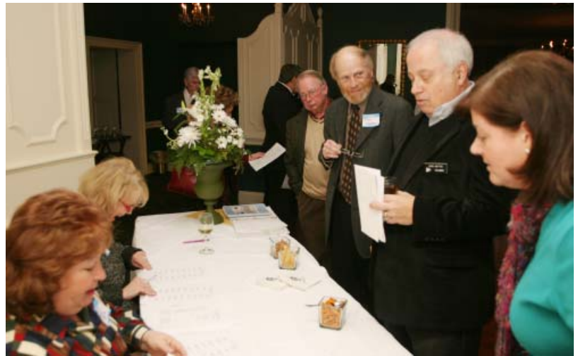
Balloting in progress